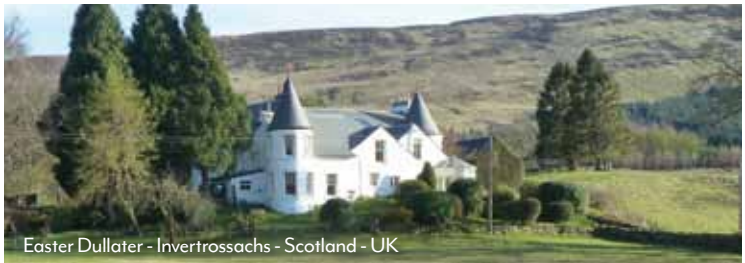
Easter Dullater - Inverrossachs - Scotland - UK