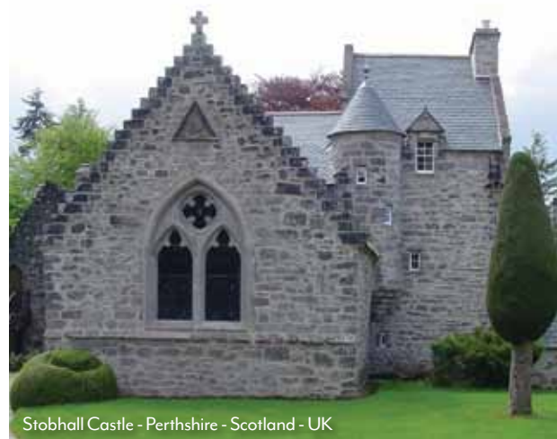
Stobhall Castle - Perthshire - Scotland - UK