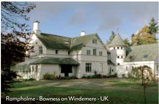
Rampholme - Bowness on Windemere - UK