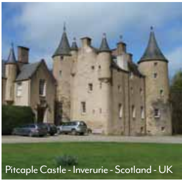
Pitcaple Castle - Inverurie - Scotland - UK