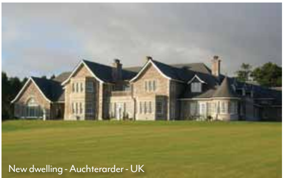
New dwelling - Auchterarder - UK