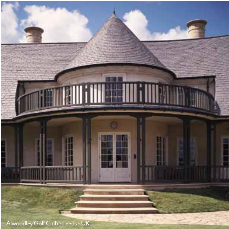
Alwoodley Golf Club - Leeds - UK