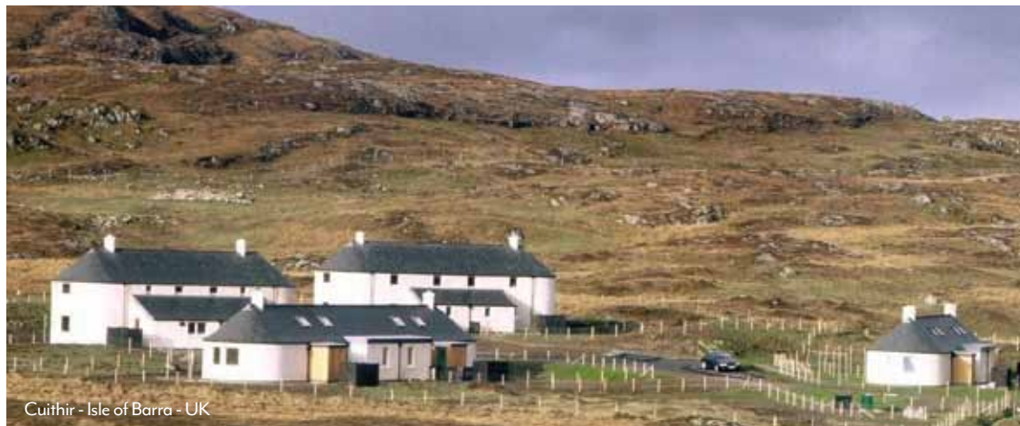
Cuithir - Isle of Barra - UK

Available in random lengths and widths, the slates can be laid in diminishing courses with the largest slates used at the eaves and gradually smaller sizes as you work up to the ridge. This tradition of laying slates in diminishing courses gives a pleasing visual perspective to the roof. Slates can also be supplied in a sized format (fixed lengths with random widths) which helps to retain a traditional random element to the roof design, whilst speeding up the laying process and keeping the cost of installation down. For a regular half bond pattern to the roof, slates are available with a fixed length and fixed width.