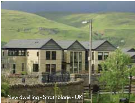
New dwelling - Strathblane - UK