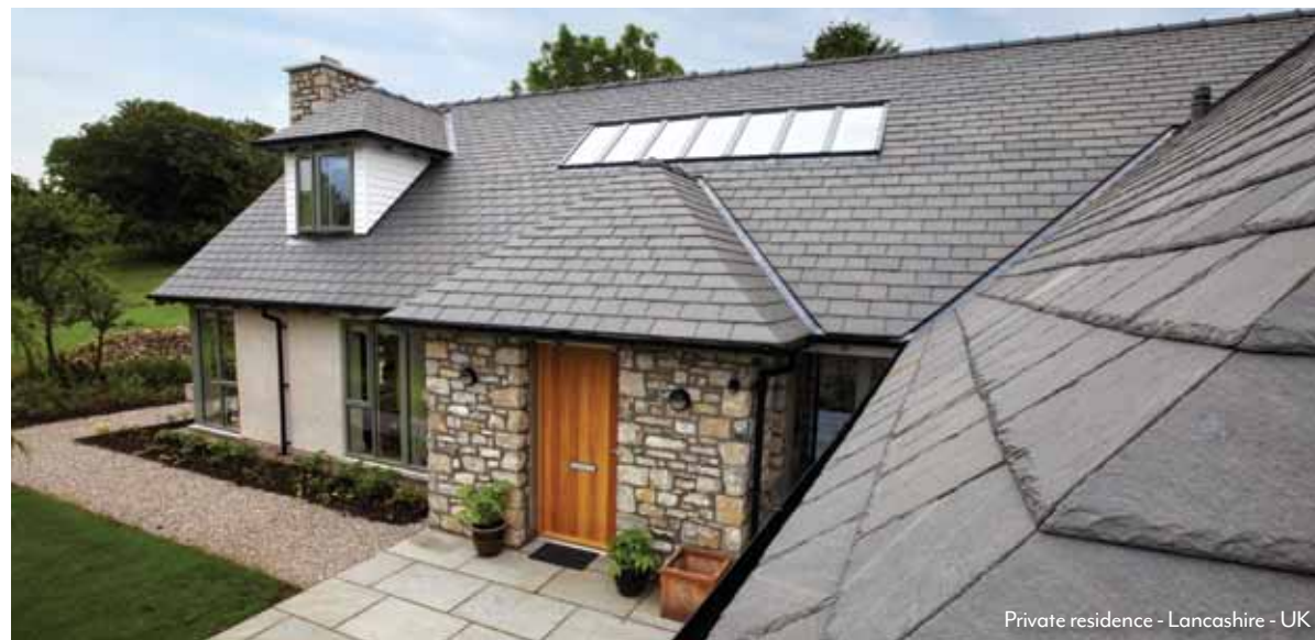
Private residence - Lancashire - UK