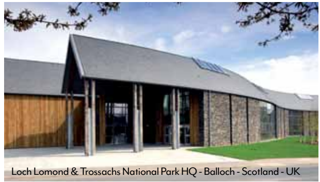
Loch Lomond & Trossachs National Park HQ - Balloch - Scotland - UK