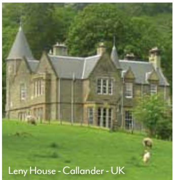
Leny House - Callander - UK