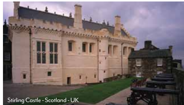
Stirling Castle - Scotland - UK