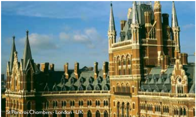
St Pancras Chambers - London - UK